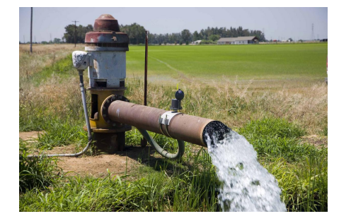
Drinking Water Vital Sign

Access to safe drinking water is critical to human health and wellbeing. The Drinking Water Vital Sign tells us about the quality of water in Puget Sound as it enters public and private drinking water systems. Protecting source water has many benefits, including reduced risk to public health, improved habitat for fish and wildlife, reduced costs associated with contamination, and increased public confidence in a safe and reliable source of high-quality water.